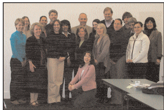
The NCIRS Team - August 2005